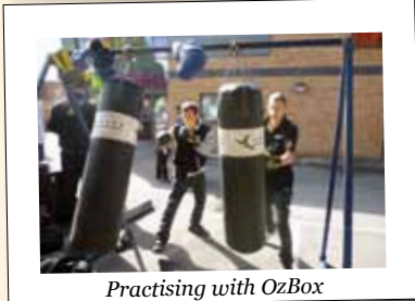
Practising with OzBox