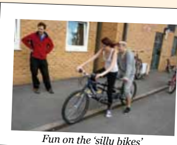
Fun on the 'silly bikes'