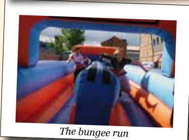
The bungee run